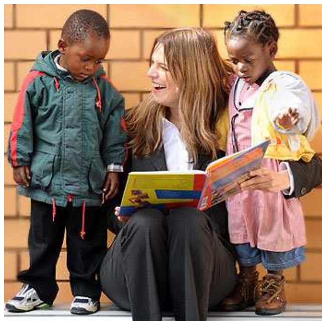
Pictured: Minister Kate Ellis during the launch at HIPPY in Elizabeth Grove.

There will be 35 HIPPY programs in operation in 2010, with the plan for a further 15 to be established in 2011.