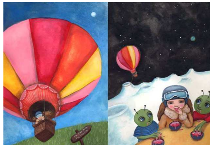
Picture from What will I dream tonight