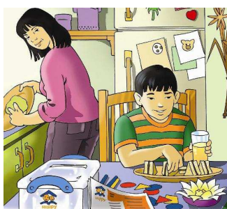
Picture from Daniel makes a friend