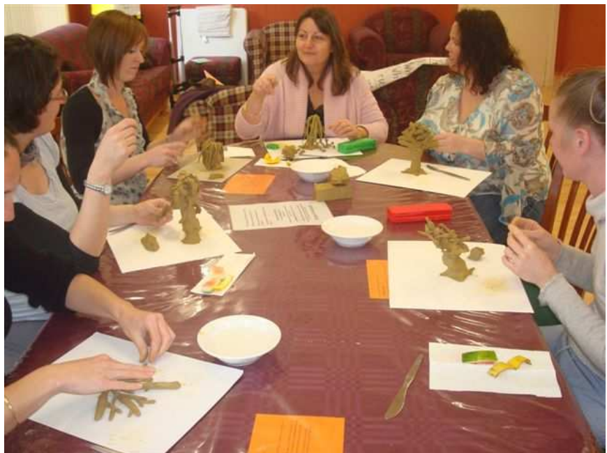
Parents at the HIPPY Colac group meeting get their hands dirty with chocolate play dough.