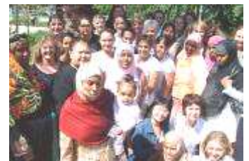
HIPPY coordinators and tutors at the training forum

We would like to say a big thank you to the Sydney Myer Fund for providing such a great opportunity for our HIPPY sites to get together, learn and help make HIPPY a success.