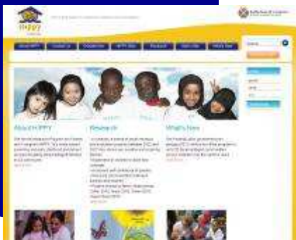
A sneak peek at the HIPPY Australia website

'Through HIPPY my child learnt counting, colours, shapes in an interesting way. It made learning fun!' 2007 parent feedback