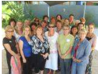
Representatives from organisations interested in running HIPPY, at the information forum in Melbourne

This information forum was attended by organisations from Western Australia,