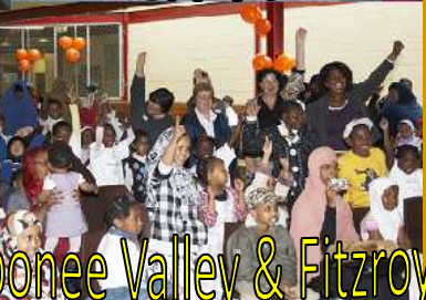
Moonee Valley & Fitzroy